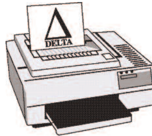
3. Image Delta film.