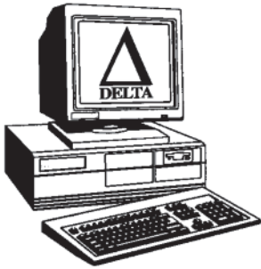
1. Design on computer.